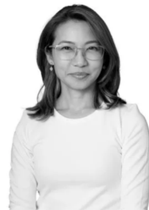
Kookkik Managing Director Philippines, Thailand, Vietnam, Cambodia, India, Myanmar, Laos, Bangla- desh, Sri Lanka, Nepal